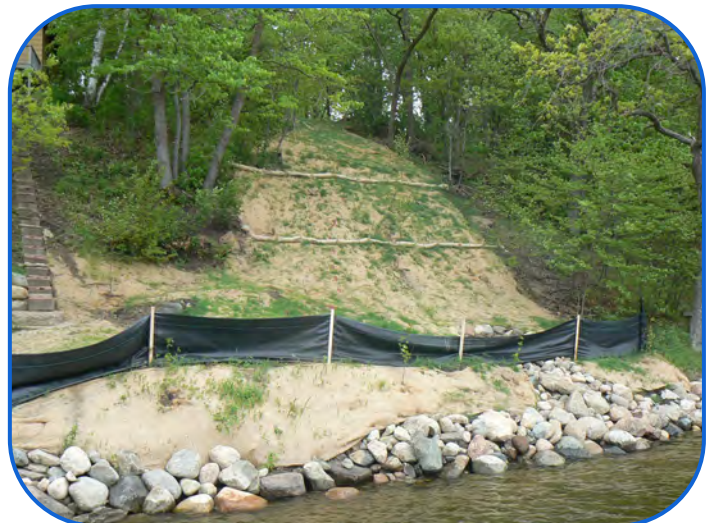
After Project – Bluff/Shoreline Restored