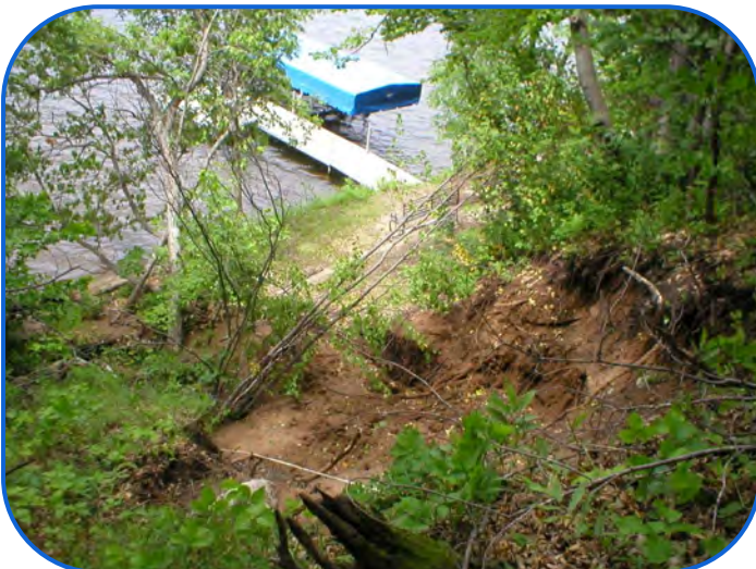
Before Project – Bluff Failure