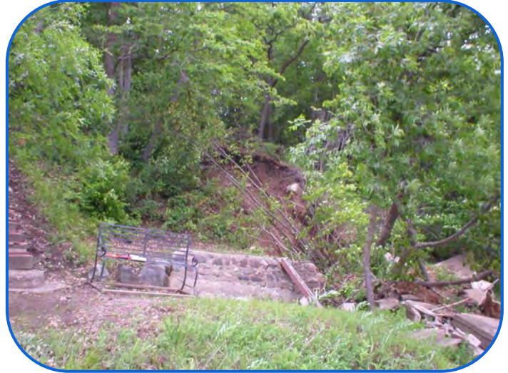
Before Project – Boathouse/Bluff Failure