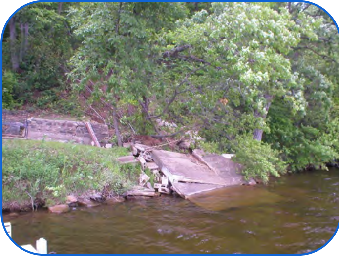
Before Project – Boathouse/Bluff Failure