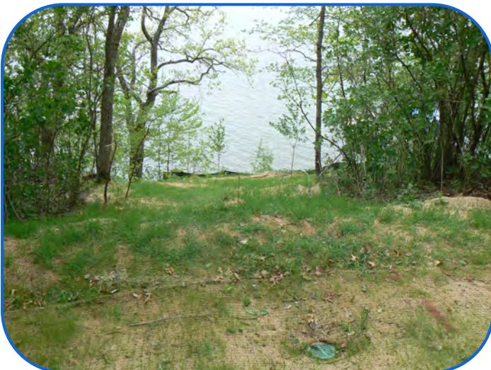
After Project – Bluff/Shoreline Restored