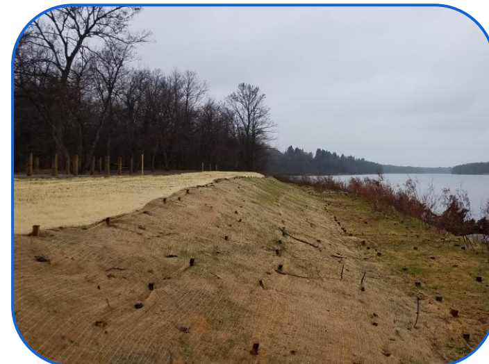
Project Site Prior To Final Planting