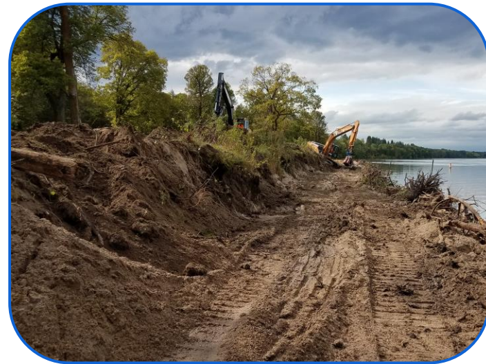
During Project Construction