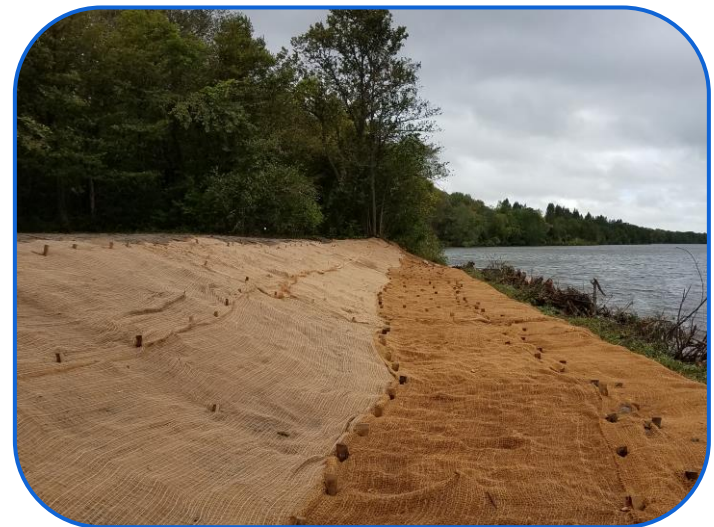
During Project Construction