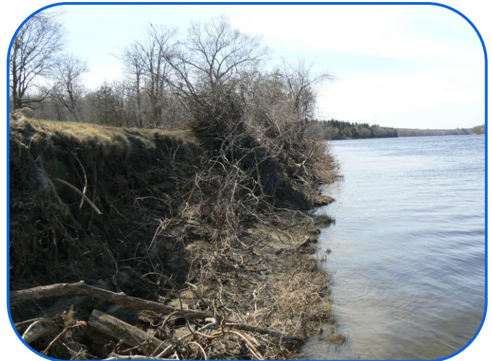
Before Project Streambank Erosion