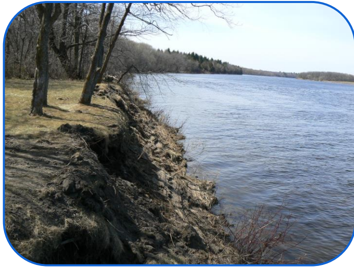
Before Project Streambank Erosion