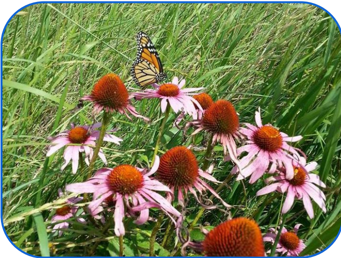
Monarch Butterfly on Coneflower