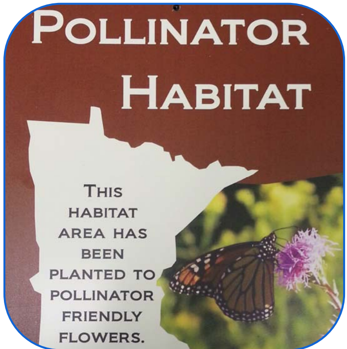
Pollinator Habitat Signage