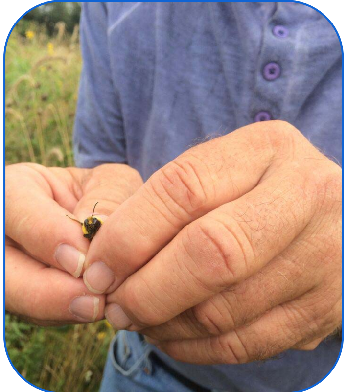
Brown Belted Bumble Bee