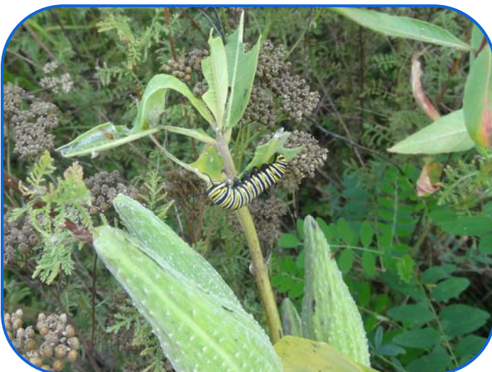
Monarch Caterpillar on Milkweed