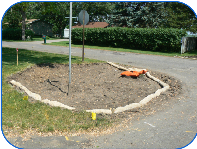
Raingarden Under Construction