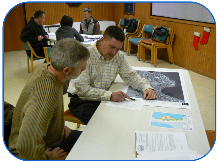
Project Planning Meetings